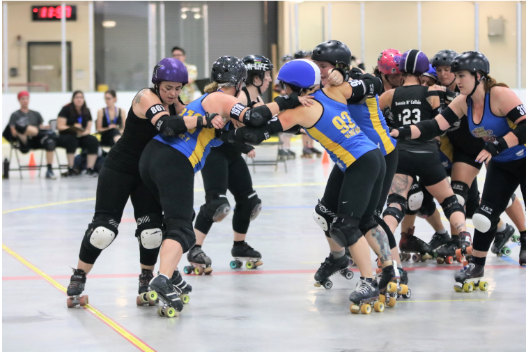
High resolution photos available on request.